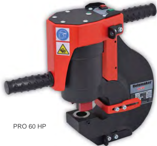
PRO 60 HP