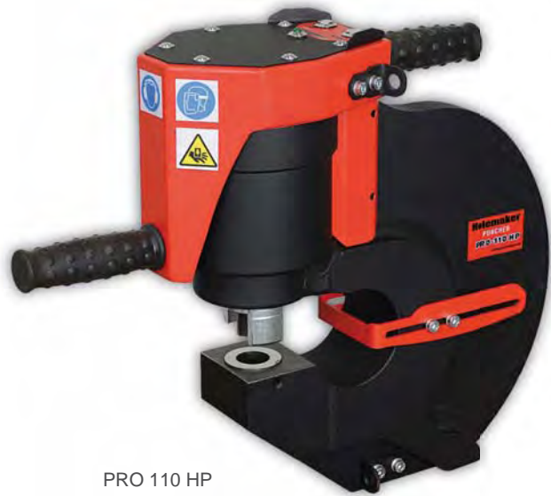
PRO 110 HP