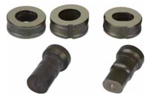
Special shaped high efficiency punches and dies available