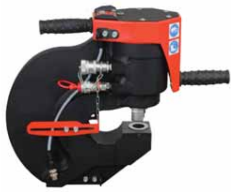
Ergonomic location of ports on rear of machine