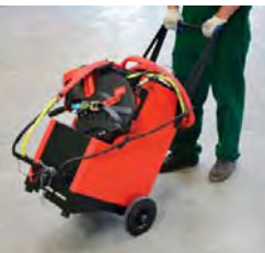
Ideal for portable use.