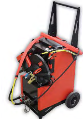
Pictured with the Holemaker PRO 110 HP Portable Double Action Hydraulic Punch.

Quality European manufacture. Portable Hydraulic Power Pack, suitable for use with Holemaker Portable Double Action Hydraulic Punches. The HPP 700 features a shelf for conveniently transporting the punch.