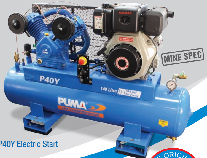
P40Y Electric Start