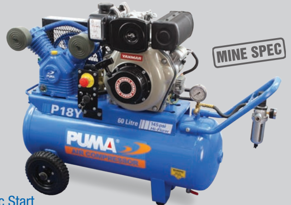
P18Y Electric Start