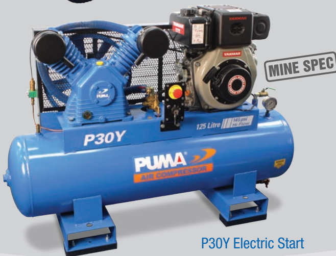
P30Y Electric Start