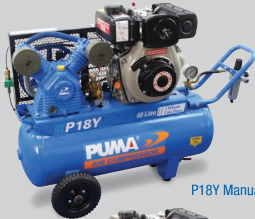
P18Y Manual Start