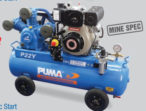
P22Y Electric Start