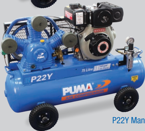
P22Y Manual Start