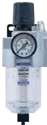
ALEMLUBE FILTER, REGULATOR, LUBRICATORS

The heavy duty adjustable spring assembly retrieves the 15m of 6mm ID rubber hose even when fully extended and the reel has a maximum working pressure of 300psi.