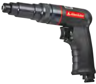
61164 1/4" PISTOL SCREWDRIVER