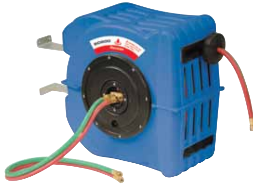
SO600 OXY ACETYLENE HOSE REEL