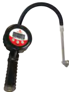
51114 DIGITAL TYRE GAUGE