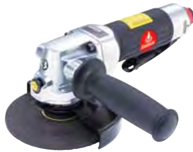
61174 4" DISC ANGLE GRINDER