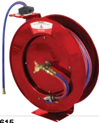
OS615 OXY ACETYLENE HOSE REEL